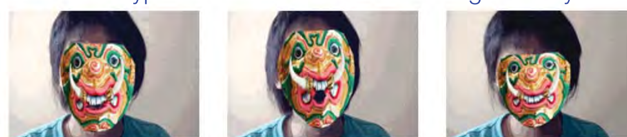
The Prototype of Emoti-Khon Facial Recognition System

This media installation visualizes human's emotional expression by transforming human's faces into Yaak (giant) if the person is in the negative emotion, Pra (prince) if the person has positive mood and Ling (monkey) if the person is in a playful mood. These transformation is done using computer vision, and facial recognition technique and project on the wall as the mirror for people to realize their emotion.